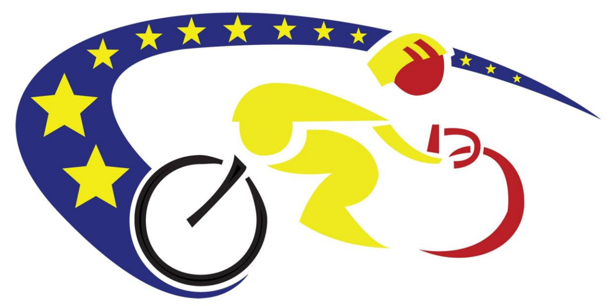
Bruges/Eeklo - Belgium 15-20 August 2016