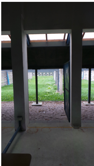
50m Shooting range