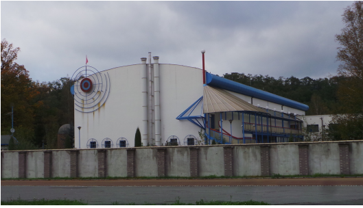
House of Shooting range