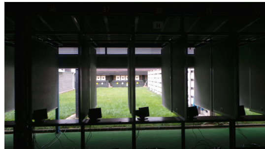
25m Shooting range