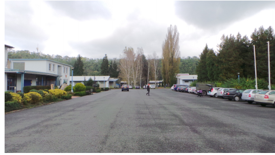
Place of Open ceremony