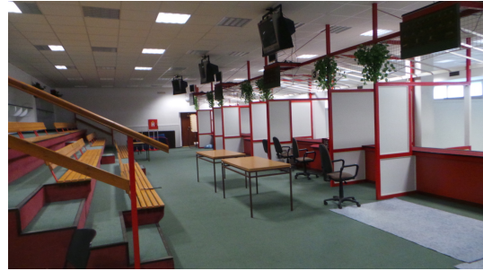
Room of weapons and clothes control