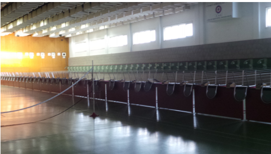
10m Shooting range